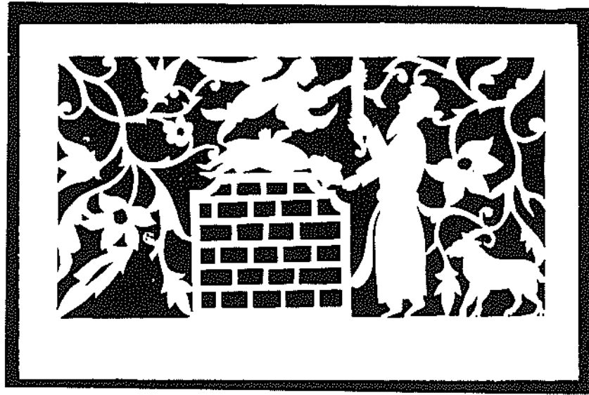
Plate 3. Portrayal of the Akedah (the Binding of Isaac) against the background of a latticework of flowers. Abraham is wearing a 'shtraimel' a 'Kaputa' and a 'gartel' (belt) e.g. traditional Hassidic garb.

The beginning of the twentieth century saw the disappearance of the art and most of the preserved specimens were destroyed during World War II. (See page 18)