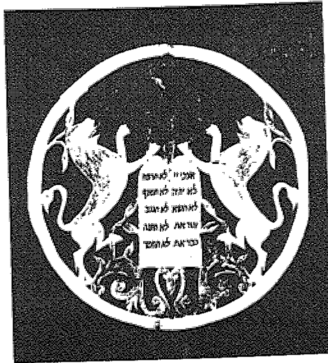
Plate 2 - circular paper cut - in the center, the traditional motif of two lions flanking the two tablets of the covenant (bearing the ten commandments). above: a gold crown, below and around: ornamentation of vegetation.

vision. On the other hand, each generation that does its share that, forges a link in the chain - becomes part of the covenant. This is the basis of the rabbinic tradition that all Jews who ever lived - or will live - stood at Sinai and heard the proclamation of the covenant. It is that moment - that standing before Sinai to accept the covenant - that is symbolically reenacted every year on the morning of Shavuot.